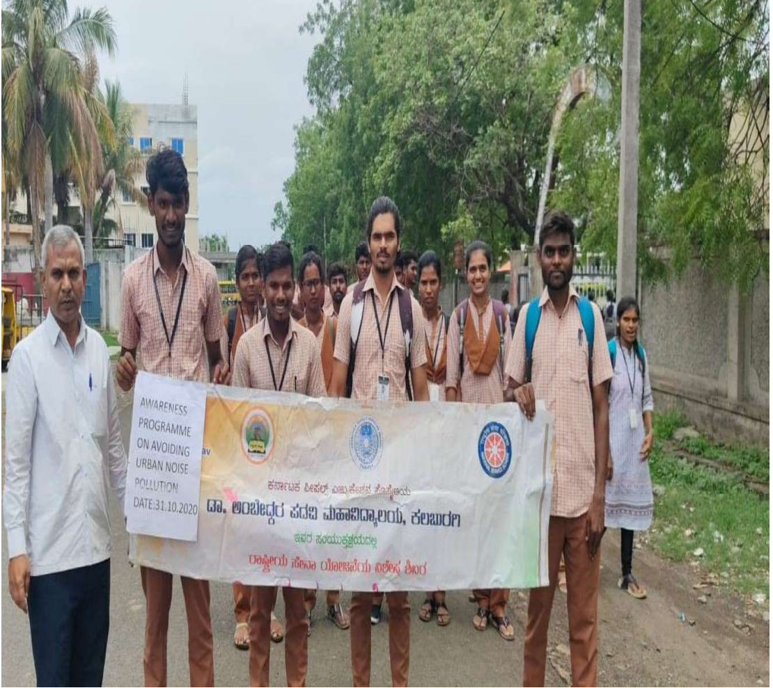
Students of NSS are organizing Awareness Programme on Avoiding urban noise pollution drive on October 31 th 2020, at 10:30 AM in Sundar Nagar, Kalaburagi

(Affiliated to Gulbarga University, Kalaburagi)