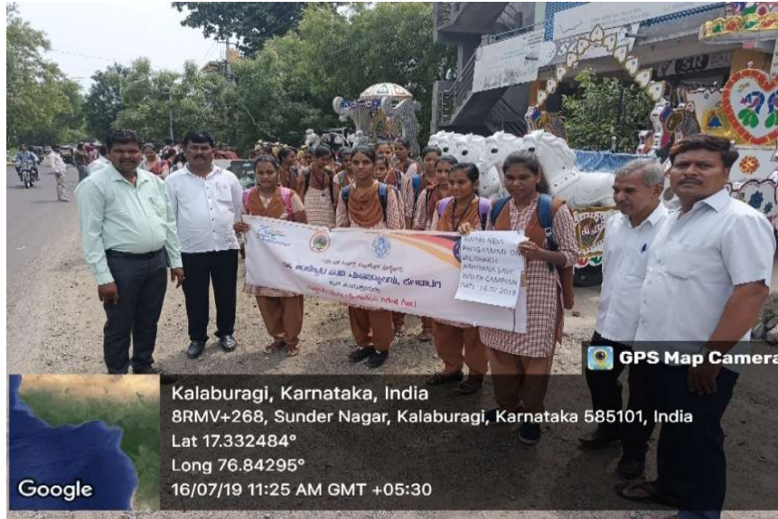
Students of NSS are organizing an Awareness Programme on Jal Shakti Abhiyan: Save Water Campaign on July 07 th 2019, at 10:30 AM in Sundar Nagar, Kalaburagi.

(Signature) PRINCIPAL Dr. AMBEDKAR COLLEGE OF ARTS & COMMERCE GULBARGA